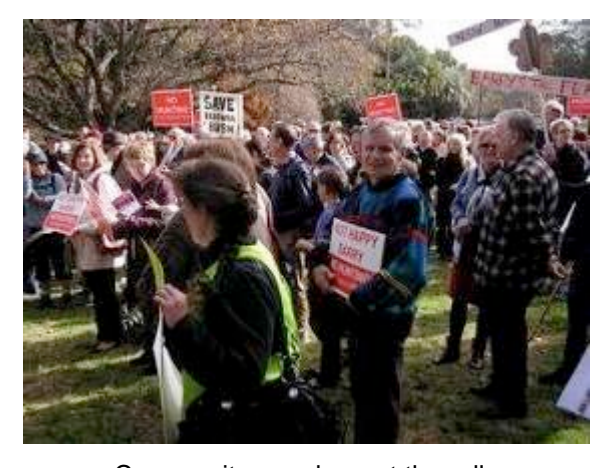
Community members at the rally

STEP assisted the National Parks Association (NPA) of NSW and the Nature Conservation Council (NCC) of NSW to organise a rally in the Premier's electorate to inform the public about the issue and demonstrate the level of ground level community opposition to the proposal.