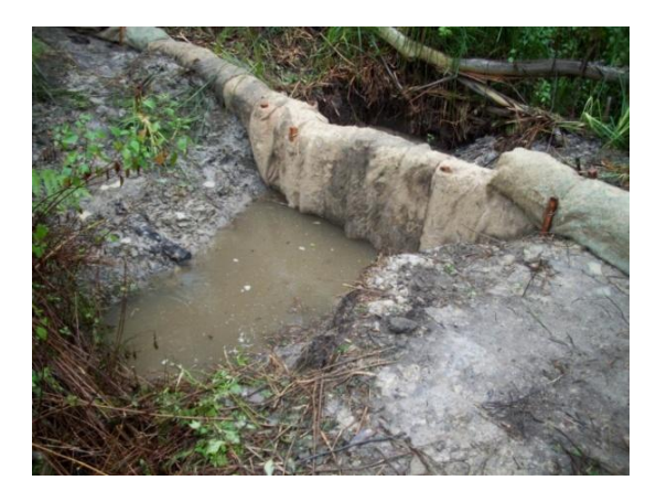
Figure 4. Phillip Road outlet stabilisation and treatment (complete and operating)

To date a total of 84 people have attended the workshops and there is an increasing level of interest in the rebates.