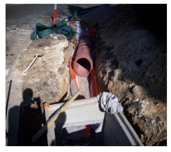
Figure 2. Milburn Place stormwater filter pipe