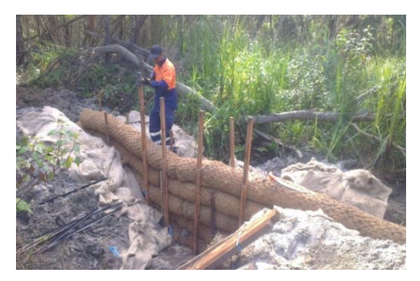
Figure 3. Phillip Road outlet stabilisation and treatment (during construction)