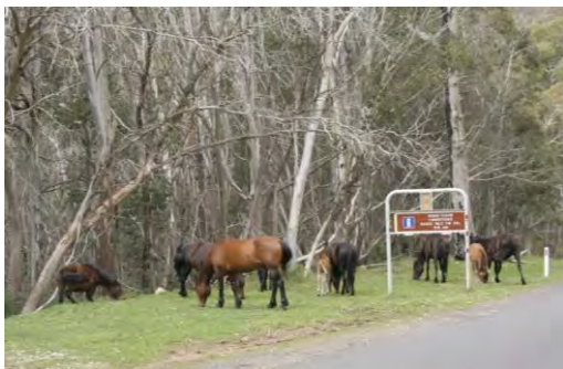
Wild horses grazing on the Alpine Way

Feral/wild horses can also pose a biosecurity risk for spread of disease, as well as pose visitor and public safety risks such as on high speed roads and highways.