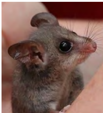
Eastern Pygmy Possum

Come along to this presentation to hear all about Eastern Pygmy Possums, Grey-headed Flying-foxes, microbats and more!