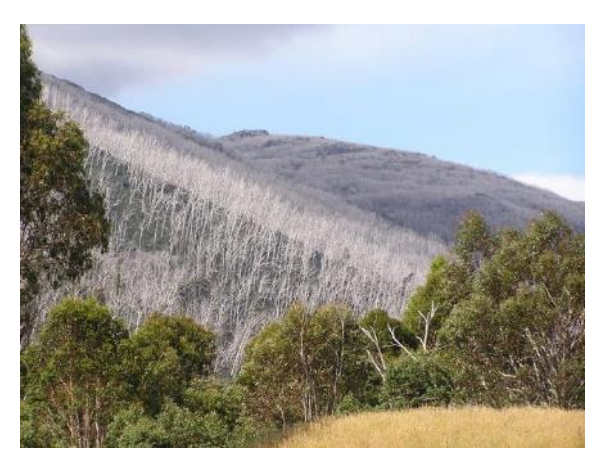
Fig 2. Alpine Ash forest post-fire at Thredbo

Fig 2 was taken in Thredbo Valley in 2010 and shows a dead forest of alpine ash, Eucalyptus delegatensis , floored by a dark green miniforest of saplings from the seed bed. Many western US forests pictured on the web show a strongly similar recovery pattern (see Fig 1). However, others may be laid open to invasive species or gradual conversion to shrubland or grassland.