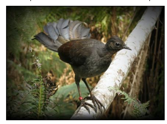
A colour-banded female lyrebird in Sherbrooke Forest, Victoria. Her powerful claws are used for foraging in litter and soil. Meghan Lindsay

Over a two-year period, we tracked changes in the litter and soil, and measured the amount of soil displaced inside and outside of these plots.