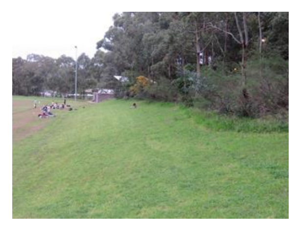
Bank above Norman Griffiths Oval

Following the decision not to proceed with the plan for artificial turf on Mimosa Oval (see STEP Matters, Issue 204) attention has returned to Norman Griffiths Oval. The original proposal for artificial turf on this oval was knocked back because of the high cost of stormwater management. The oval currently acts as a detention basin for water coming from the upper reaches of Quarry Creek and higher parts of Bicentennial Park.