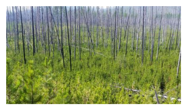
Fig 1. Lodgepole pine post-fire regrowth in Montana

You'll be aware of Californian redwoods Sequoia sempervirens especially if you've visited memorable Muir Wood near San Francisco or any of the reserves of these giant trees growing within a 750 km long near-coastal zone. Yes, they can and do burn but are quite fire resistant having tough, thick bark and very high crown bases, and they also resprout epicormically quite readily. Often their forests have open floors and this is encouraged in a general movement towards hazard reduction burning of understory where possible. <a href="https://slate.com/technology/2020/09/redwoods-california-fires-climate-change.html">https://slate.com/technology/2020/09/redwoods-california-fires-climate-change.html</a>.