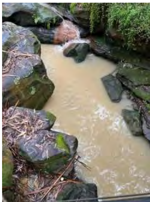
Muddy water in Quarry Creek near Yanko Road (30 June 2024)

The EPA is still considering all these incidents and may take further action.